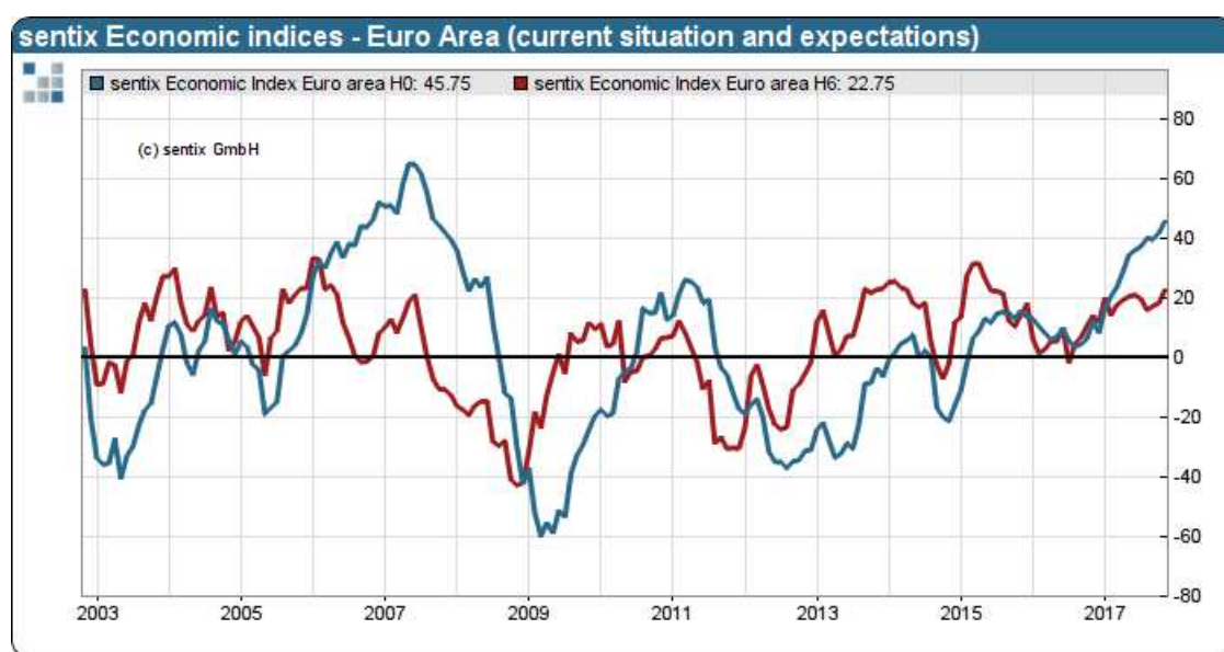
sentix Economic Index for the Eurozone: current situation and expectations

In Euroland, things are starting to get good again. The sentix economic index has risen to its highest level since July 2007. It could not be more clearly documented that at least the real economy has coped with the crisis. In the meantime, the upturn has been so broad that in many countries of the eurozone the employment situation is beginning to improve in the long term. Even in Italy, economic data is clearly up.